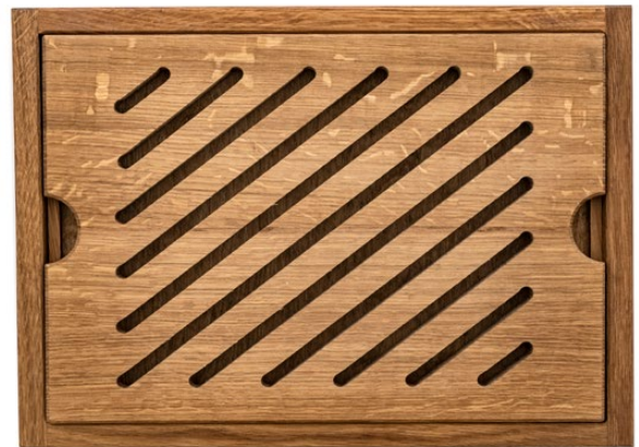
Art. Nr.: PR-DE-333 • breadboard insert • 400 x 280 x 27 mm • 2000 g • beech • oiled