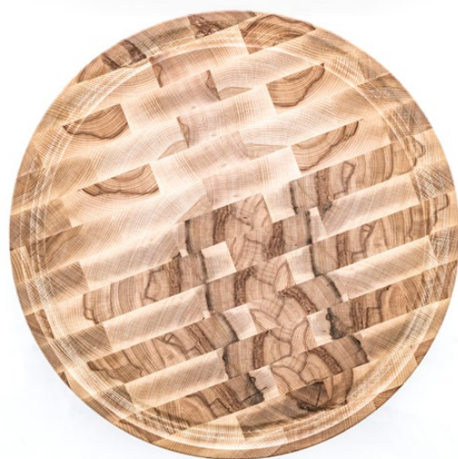
Art. Nr.: PR-DE-328 • grooved butcher • Ø380 x 50 mm • 4000 g • beech • oiled