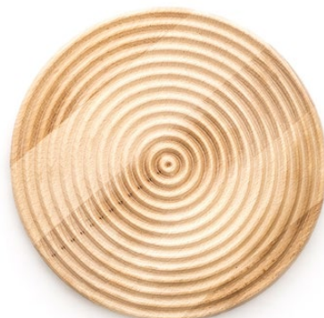
Art. Nr.: PR-DE-346 • circular ZEN • \varnothing 260 \times 20 mm • 1000 g • beech • untreated