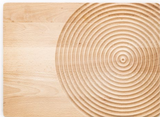
Art. Nr.: PR-DE-345 • squared ZEN • 380 x 280 x 20 mm • 1700 g • beech • oiled